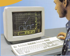
Computerised Lift Plan Simulation